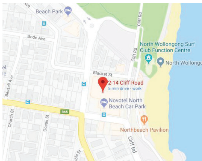
Novotel Wollongong Northbeach 2-14 Cliff Rd, North Wollongong, NSW 2520