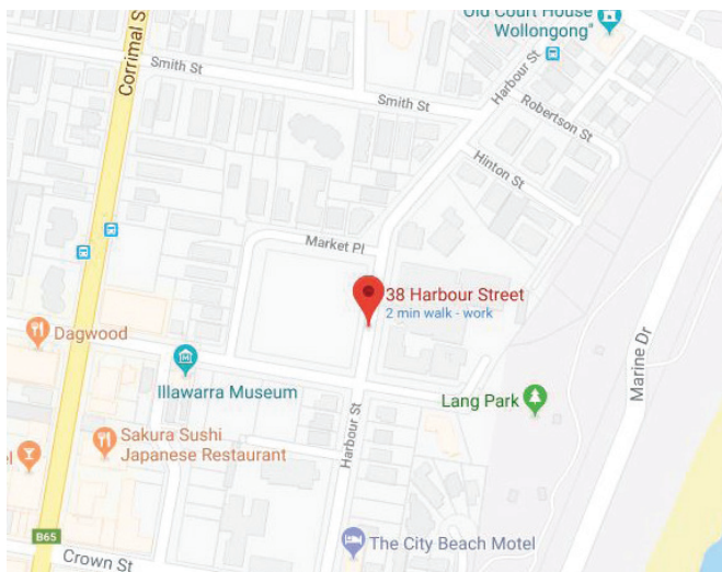
Xavier Centre 38 Harbour Street, Wollongong, NSW 2500